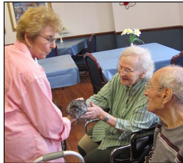
Residents enjoying an afternoon with a few interesting animals