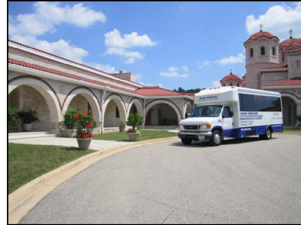
Residents and staff spent a wonderful afternoon at the Monastery